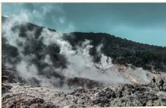
Queen Crater of Mt. Salak