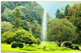
Cibodas Botanical Garden