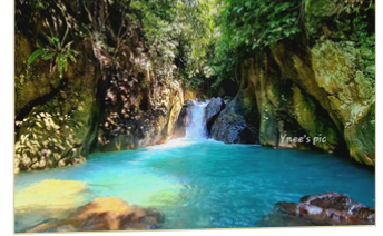
Leuwi Hejo Waterfall