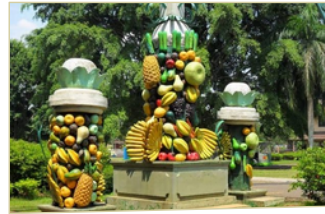
Mekarsari Fruit Park