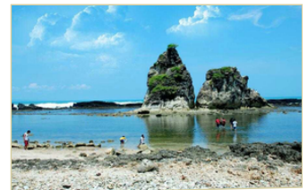
Ujung Genteng Beach