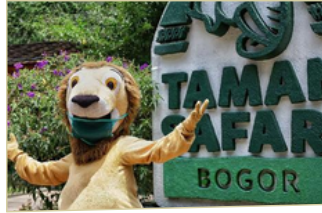
Safari Park Indonesia