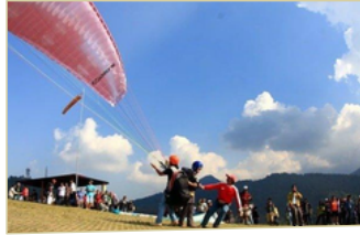
Paragliding Gantole Hills