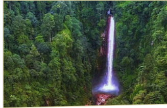
National Park Mt. Halimun Salak