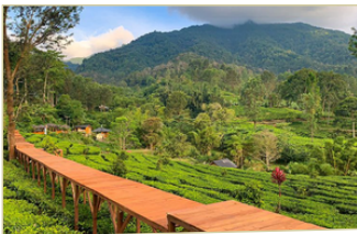
Gunung Mas Agrotourism