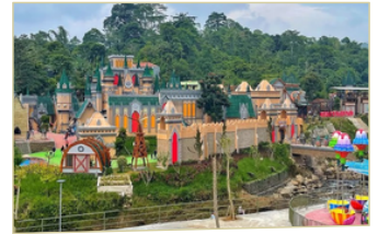
Nicole's River Park