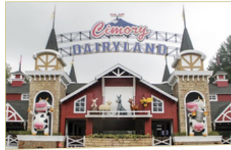
Cimory Dairy Land