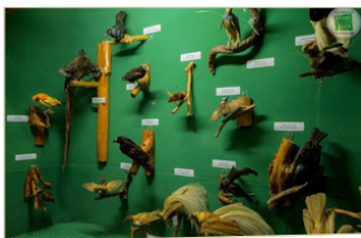
Bogor Zoological Museum