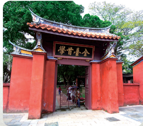
Tainan Confucius Temple

Tainan is the ancient capital of Taiwan, and is proudly the home to a total of almost 2,000 historic Taoist or Buddhist temples. This city continues to host a variety of cultural festivities and religious ceremonies all year round. Traditions have been well sustained in this modernized city. The city's gourmet food culture guarantees one can find delicious food of every kind. Life in Tainan has a charming balance between the new and the old, and the fast and the slow.