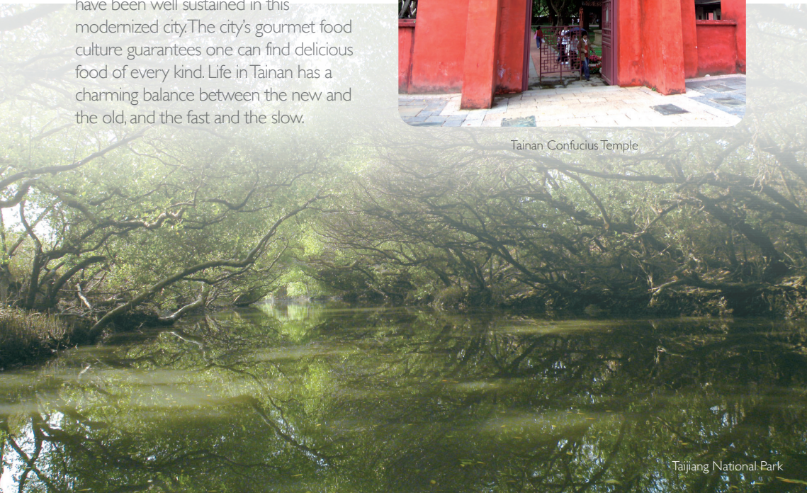
Taijiang National Park

** NCKU provides on-campus dormitories for exchange students. Room availability is not guaranteed due to changes in demand each year. NCKU will advise you on off-campus accommodations upon request.