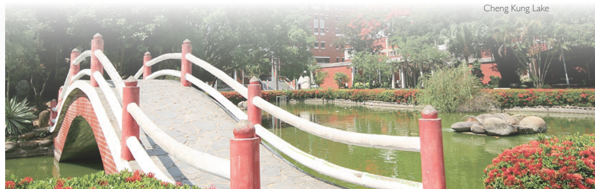
Cheng Kung Lake

Program on Integrated Circuit Design Program on Semiconductor Technology Program on Semiconductor Packaging and Testing Program on Key Materials Program on Smart and Sustainable Manufacturing