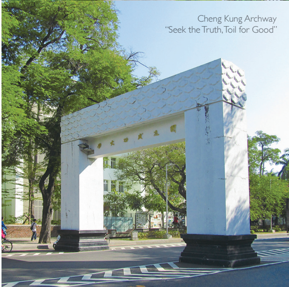
Cheng Kung Archway "Seek the Truth, Toil for Good"